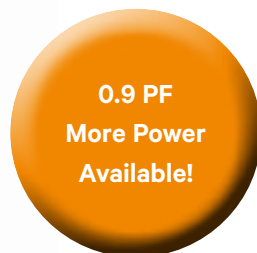
Liebert GXT3 10000 VA Tower