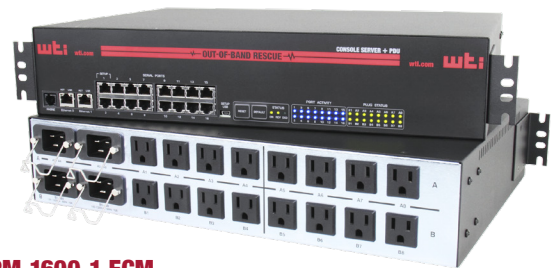
CPM-1600-1-ECM Dual GigE, 16 Port Console Server + 16 Outlet PDU