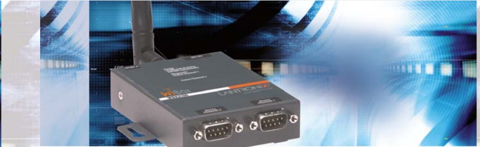
WiBox 2100E Quick Start Guide